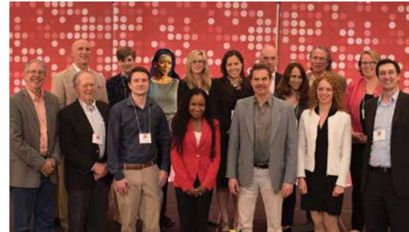
IDE team members at the 2016 Annual Conference.