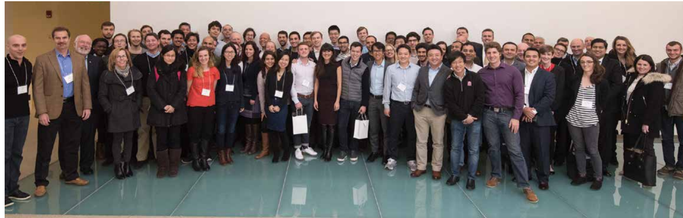
Analytics Lab class of 2016 with faculty, course mentors, and project sponsors.

Learn more about the educational offerings of the IDE at ide.mit.edu .