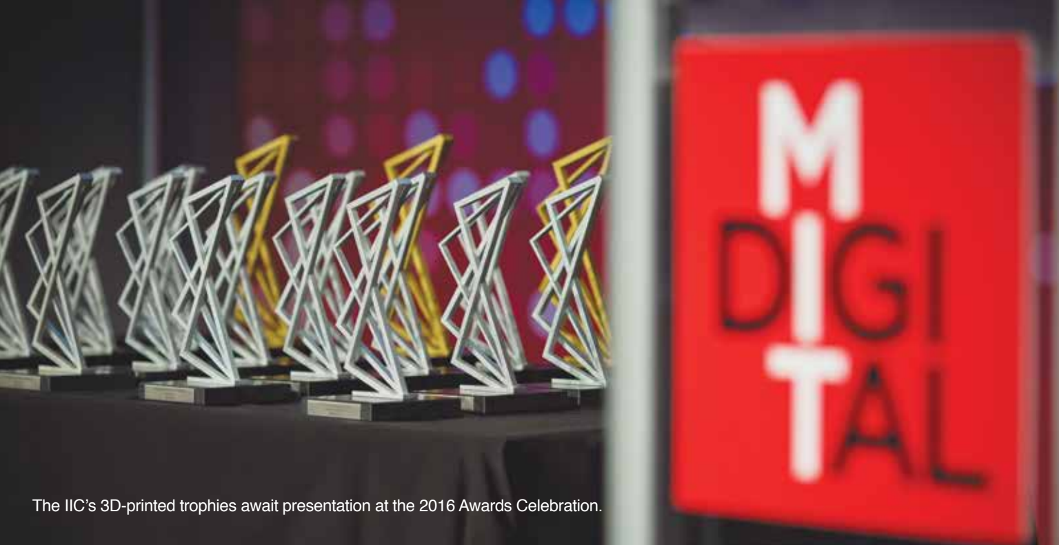
The IIC's 3D-printed trophies await presentation at the 2016 Awards Celebration.