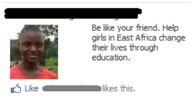
Figure 1: Sample Ad

capture all types of social influence or are necessarily successful at distinguishing between the different types of social influence that are possible. The literature on social influence has emphasized that the underlying mechanism is nuanced and complex. Obviously, different types of social influence relate and interact in ways that cannot be teased apart simply with different wording. However, the variation in messages does allow us to study whether explicit advertising messages that attempt to use different types of wording to evoke social influence are effective in general.