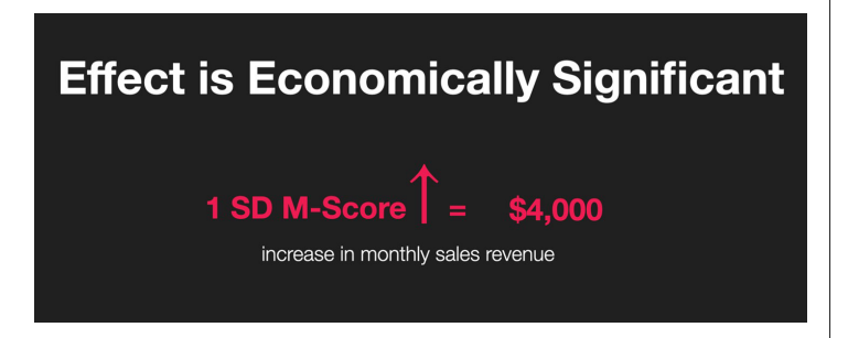
Fig. 1: A video's m-score correlates with additional sales

The TikTok platform also has approximately 3 million influencers — video ad creators who simultaneously entertain viewers while selling them products. These influencers have quickly emerged as major marketers. One of TikTok's biggest influencers in China, a young man named Li Jiaqi, recently sold more than 7 million units of lipstick in just one day, worth an estimated $145 million. Such huge marketing impact has caught the attention of companies including Walmart, the world's largest retailer, which recently tested product-driven TikTok videos.